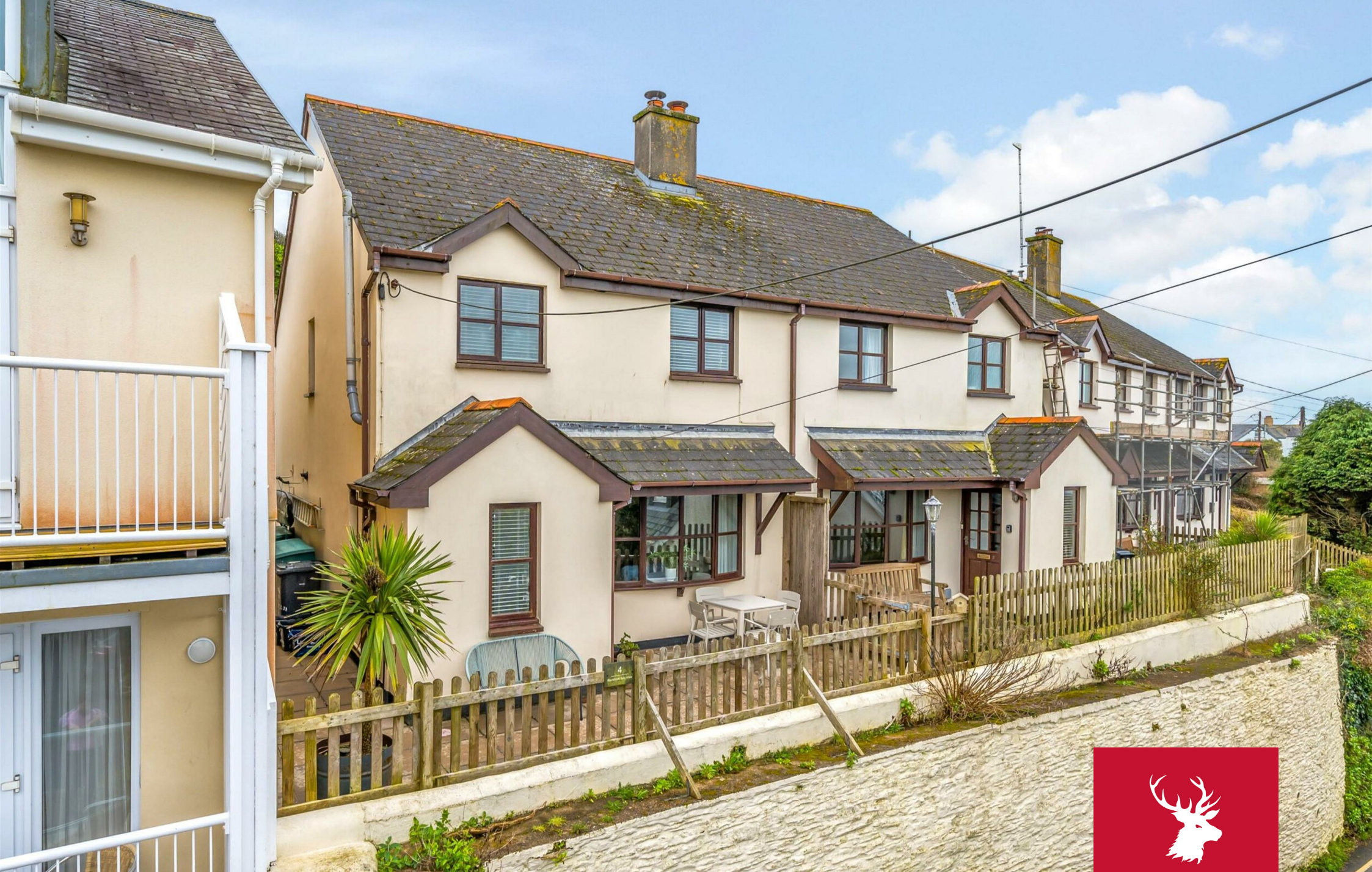
4 Rockham Bay View